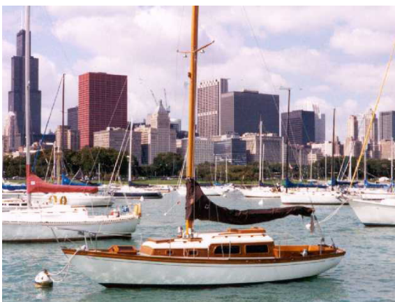
Mark I on the left with teak dorade boxes Mark II on the right with fibreglass boxes

The boats were obviously designed with the CCA rule in mind because of the headsail configuration. And by today's standards their velocity programs would be a bit sedate. But they were quite seaworthy and much loved by their owners. This one deserves a new home and restoration. The hulls were extremely well built by Cheoy Lee so it's not like restoring a wood boat. Take a look at her.